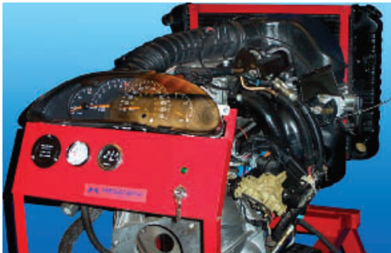
MEG520 with factory dash.