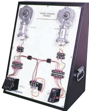
MEG801102M Power Window