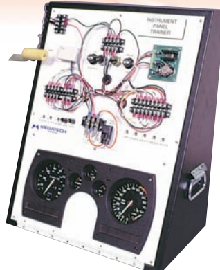
MEG801012M Instrument Panel