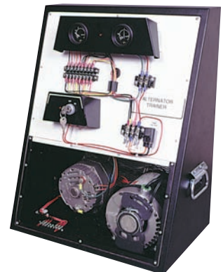
MEG801042M Alternator System