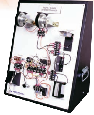
MEG801082M Horn Alarm System