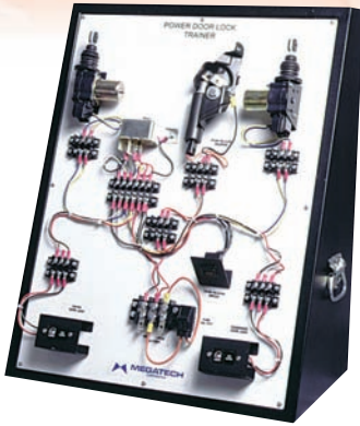
MEG801092M Power Door Lock

The series 2000 is derived from Megatech's surface mounted panel trainers with the addition of computerized fault insertion and classroom management software that can be added optionally. The system uses a fault box that is manually or computer controlled to set challenges for students to diagnose and fix. Fault panel sold separately.